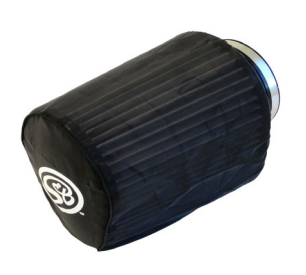
Filter Wrap SKU# WF-1031

Order Online today at www.sbfilters.com or through your local S&B distributor.